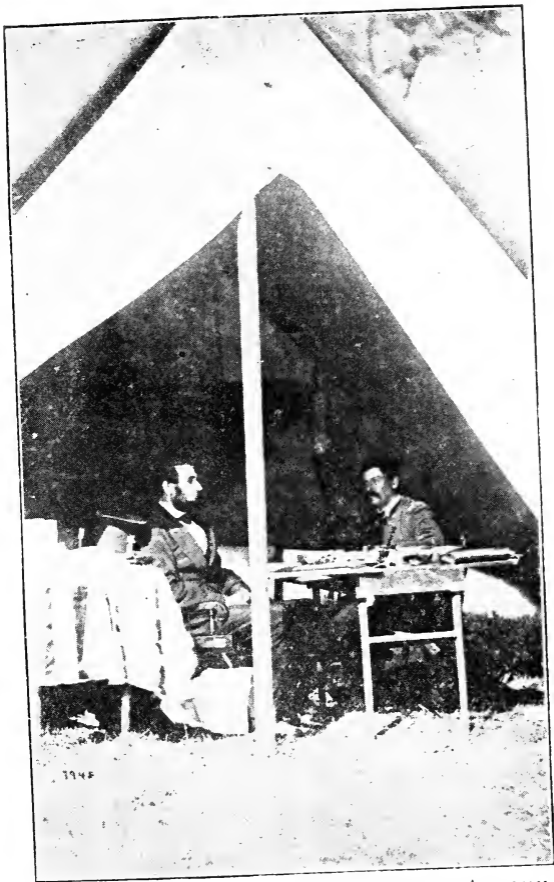
PRESIDENT LINCOLN AND GENERAL McCLELLAN AT ANTIETAM, OCTOBER 2, 1862, SOON AFTER THE BATTLE.